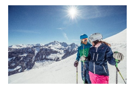
Enjoy the beautiful panorma & ski the 113 Pistekilometers in Ski Juwel Alpbachtal Wildschönau