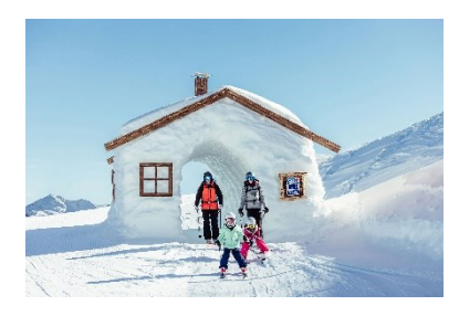
Fun & Action for all families in the Ski Juwel Alpbachtal Wildschönau